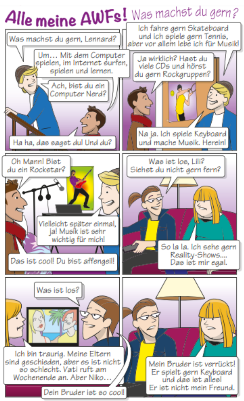
lernen to learn: das saost du vou said it: leben...für to live for: na ia... well..: Herein! Come in!: Oh Mann!